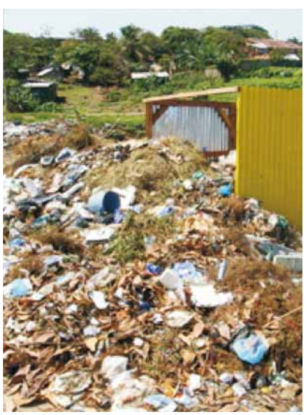
WB funded secondary-waste collection facilities at Barclay Training Centre beach, where waste generation is exceeding capacity

JICA, the Japanese aid agency, have been approached, informally, by UNMIL, but do not appear to be interested in funding this proposed project.