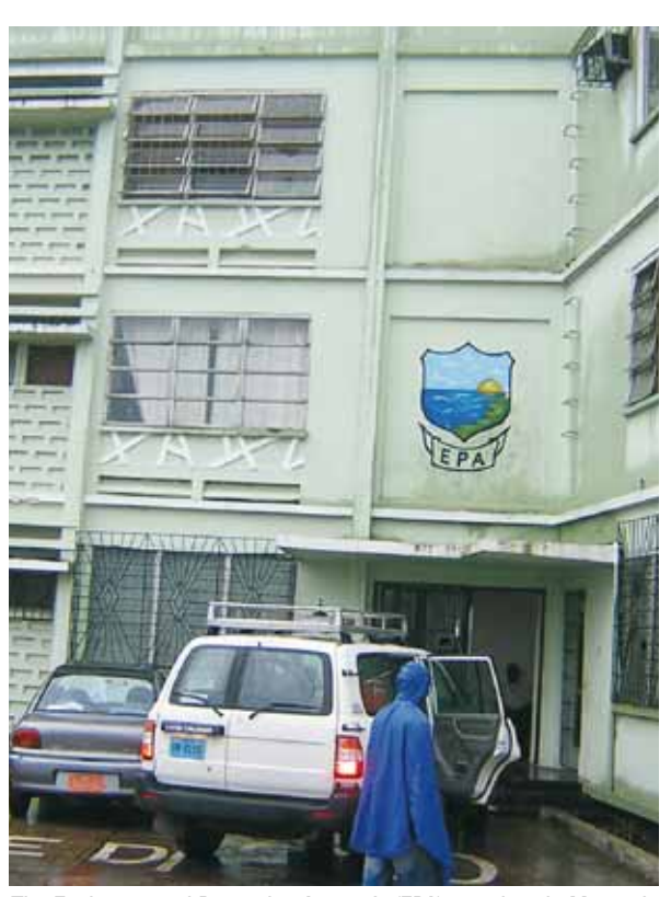
The Environmental Protection Agency's (EPA) premises in Monrovia

Further, both the municipalities of Buchanan or Kakata report that they receive between 10 and 12