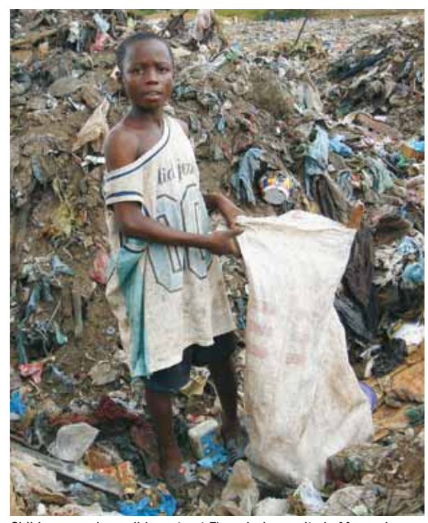
Child scavenging solid waste at Fiamah dump site in Monrovia. Young children searching for recyclable material at the Fiamah Site are at serious risk from the hazardous healthcare waste

The anticipated "temporary" use of the Fiamah dump site in Monrovia for the next 18 months will most likely not be sufficient to cope with the amount of waste disposed off over that period. Of greater concern is the fact that no engineering designs, EIA or mitigation plan have yet been undertaken for the proposed new disposal site at Mount Barclay. This despite the fact that these essential development steps, in conjunction with site construction works, can be anticipated to take between two to three years. Thus, there is a real risk that, notwithstanding its inappropriate location and limited 'foot-print', the Fiamah Site may need to be operated for a considerable period of time yet.