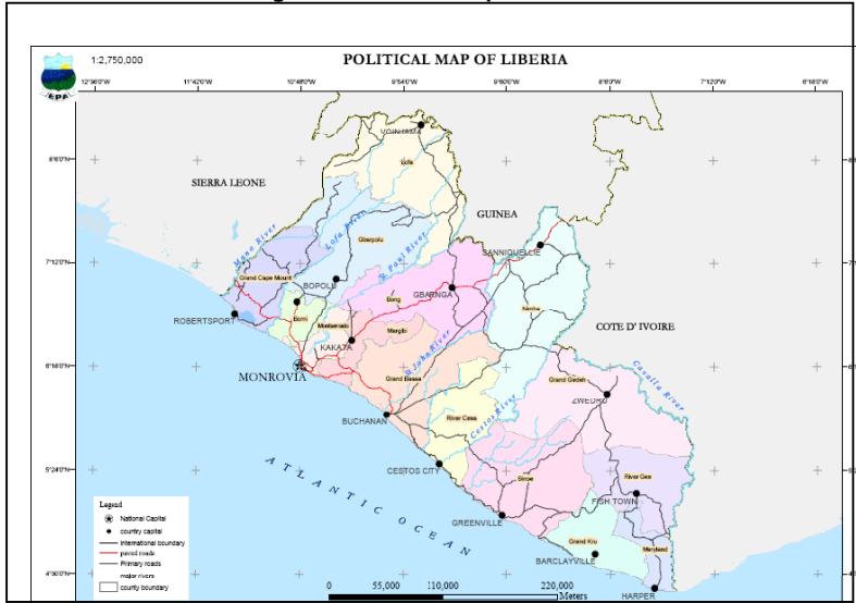
Figure 1: Political Map of Liberia

The average rainfall ranges between 4770 mm along the coast and 2030 mm in the interior. Due to the equatorial position of Liberia, the sun is overhead at noon